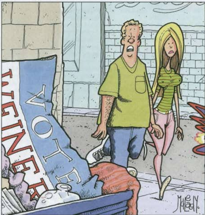
"The big difference between America's two political parties is that Democrats take pictures of their pricks and Republicans are the pricks!"